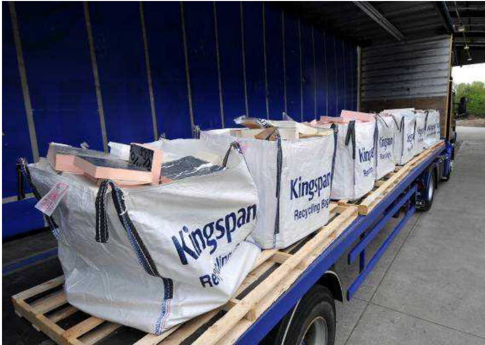
Photo: Willmott Dixon filled 10 bags with 230kg of undamaged insulation board for Kingspan's take-back scheme

The other option is for mixed waste to go to a transfer facility, where the load is separated out into different material streams. Bulking up of building insulation foam into different material streams and then transportation to a reprocessing or recovery facility would reduce transport impacts and improve recovery opportunities. In these facilities the economic viability would rest upon the overall price to send materials for recovery/reprocessing versus the price of landfill. Since landfill price is set by weight (including landfill tax), costs of the alternative (including transportation) would have to be quite low to be considered at all. Exploring the current costs and benefits of different options for specific building insulation foam wastes, compared to landfill, could help identify what options are currently practical.